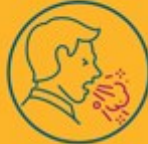
New persistent cough