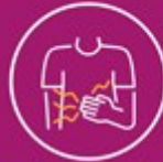
Tummy ache in children

You DO NOT NEED TO ISOLATE if you have only one or more of these precautionary symptoms , or while waiting for test results for these precautionary symptoms.